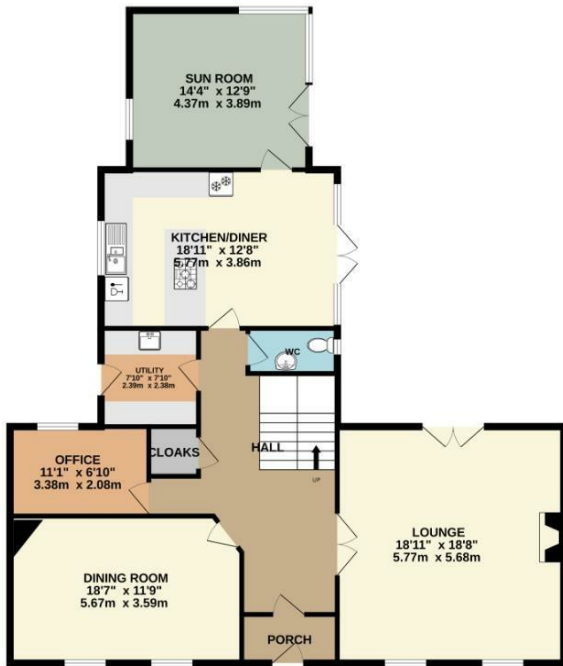
GROUND FLOOR 1406 sq.ft. (130.6 sq.m.) approx.