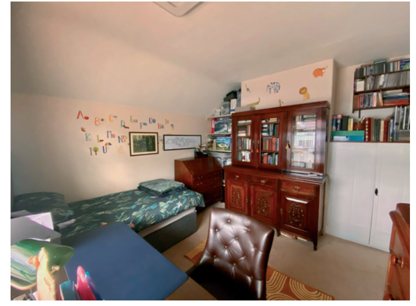
BEDROOM (4)/DRESSING ROOM/NURSERY/STUDY: 7' 0" x 6' 9" (2.13m x 2.06m)