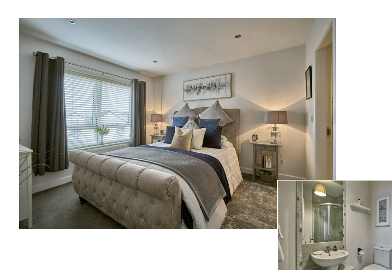
BEDROOM (2): 12' 6" x 9' 10" (3.8m x 3m)

ENSUITE SHOWER ROOM: Fully tiled built-in shower cubicle with mains shower, pedestal wash hand basin with mixer tap, tiled splash back and inset mirror, low flush wc, ceramic tiled floor, heated towel rail, Xpelair extractor fan.