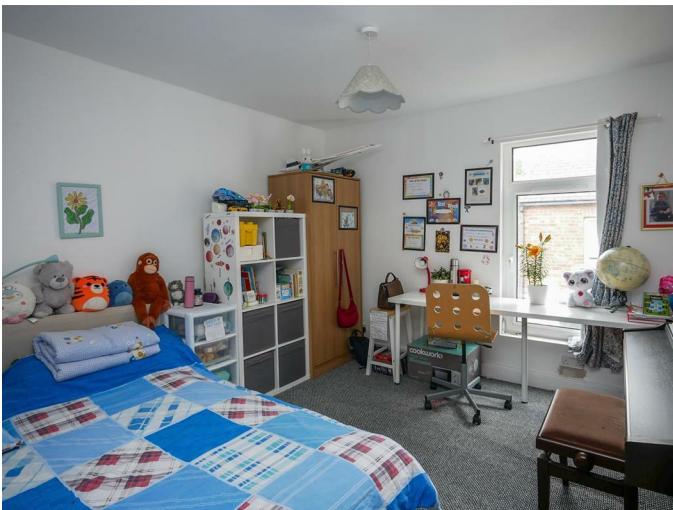
Bedroom 3 11'8 x 10'4 (3.56m x 3.15m)