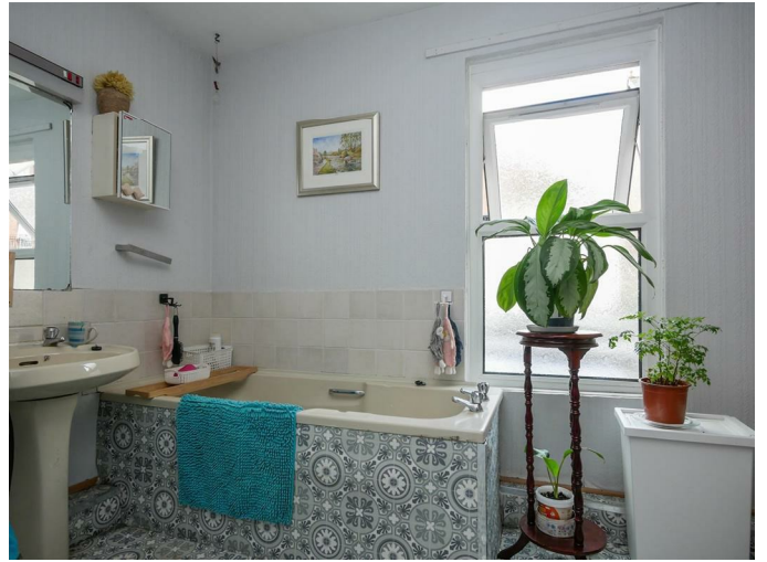
(at widest points) Coloured bathroom suite comprising of panelled bath with separate shower cubicle, pedestal wash hand basin and low flush w.c. Part tiled walls and vinyl flooring