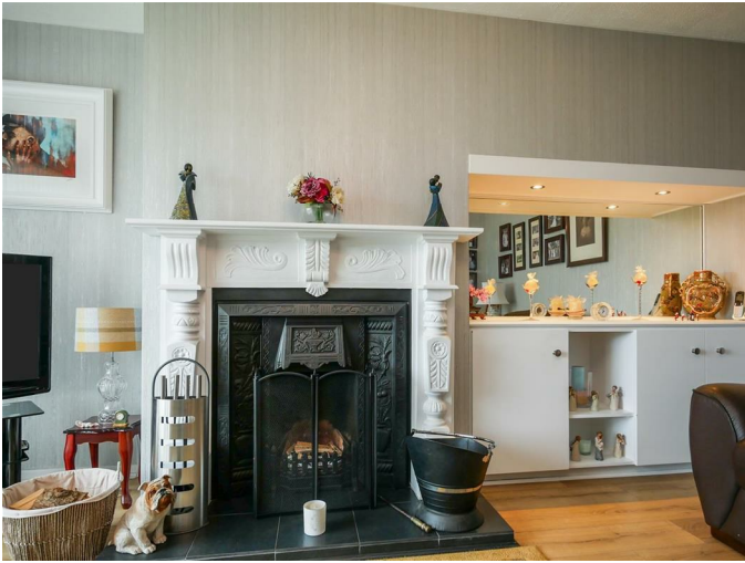
Extended Kitchen/Dining/Living 23'7 x 13'8 (7.19m x 4.17m)