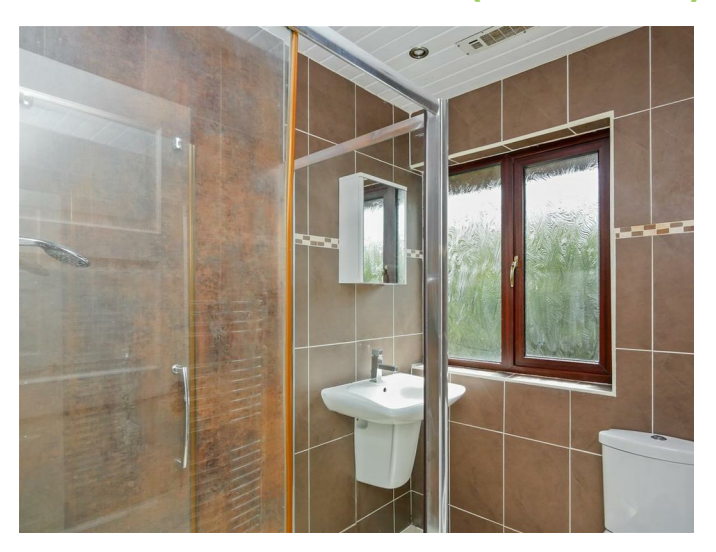
White Shower Room 6'7 x 5'9 (2.01m x 1.75m)

Comprising shower cubicle with chrome shower unit, pedestal wash hand basin with mixer taps, low flush w.c Part tiled walls. Tiled flooring. Heated chrome towel rail. Spotlights.