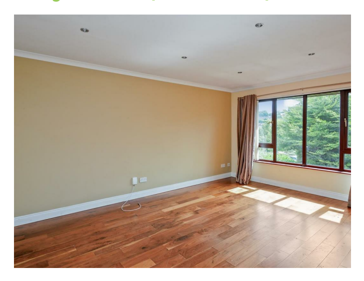
Timber flooring. Spot-lights.