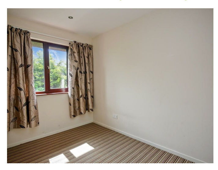
Bedroom Two 10'4 x 6'5 (3.15m x 1.96m)

Timber flooring. Lovely views out towards Cavehill.