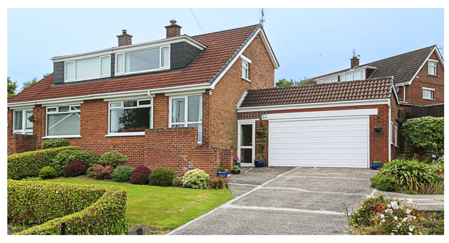
SEMI DETACHED | 3 ⊨ | 1 ≒ | 2 ⊟

We feel this home represents an excellent opportunity for those seeking a comfortable spacious living environment with generous grounds within a most desirable location.