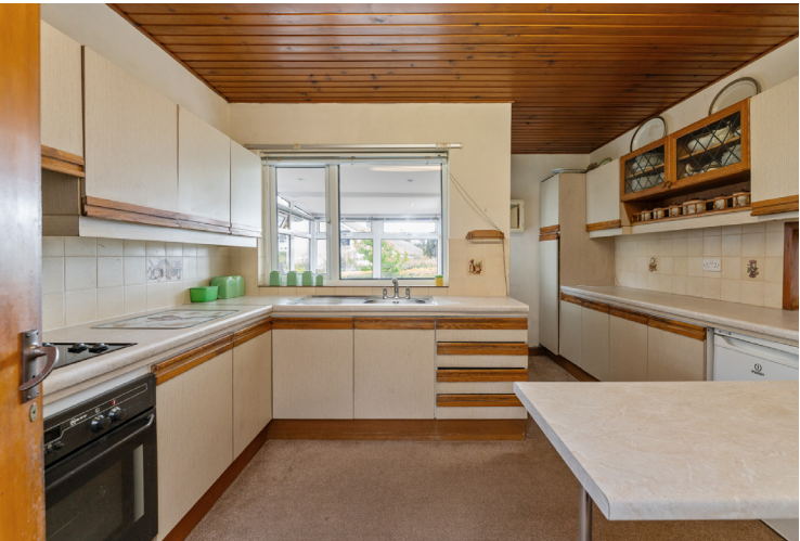
Kitchen with casual dining