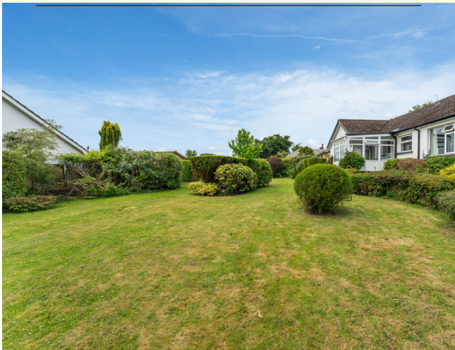
Extensive rear garden

Large gardens surrounding the house with mature hedging, flowerbeds and grass. PVC oil tank. Outside tap. Outside light.