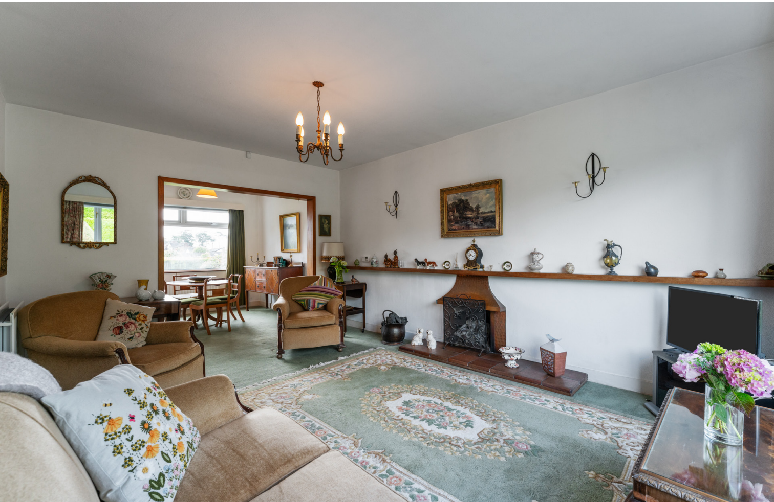
Living room opening to dining room

Only minutes from Crawfordsburn Village and Country Park