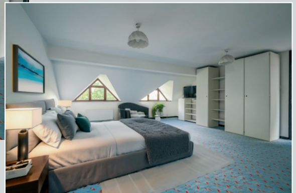
BEDROOM (3): 14' 4" x 8' 8" (4.37m x 2.64m) Built-in wardrobe and display unit.