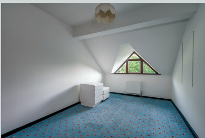
BEDROOM (4): 17' 9" x 13' 5" (5.41m x 4.09m) Extensive range of furniture including wardrobes, chest of drawers, and dressing area.