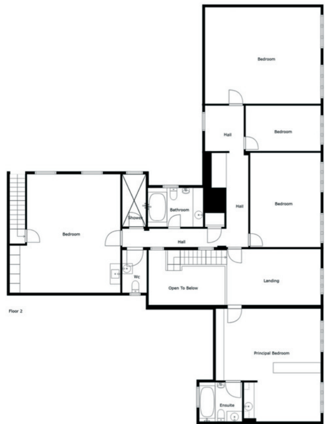
Sizes And Dimensions Are Approximate. Actual May Vary.