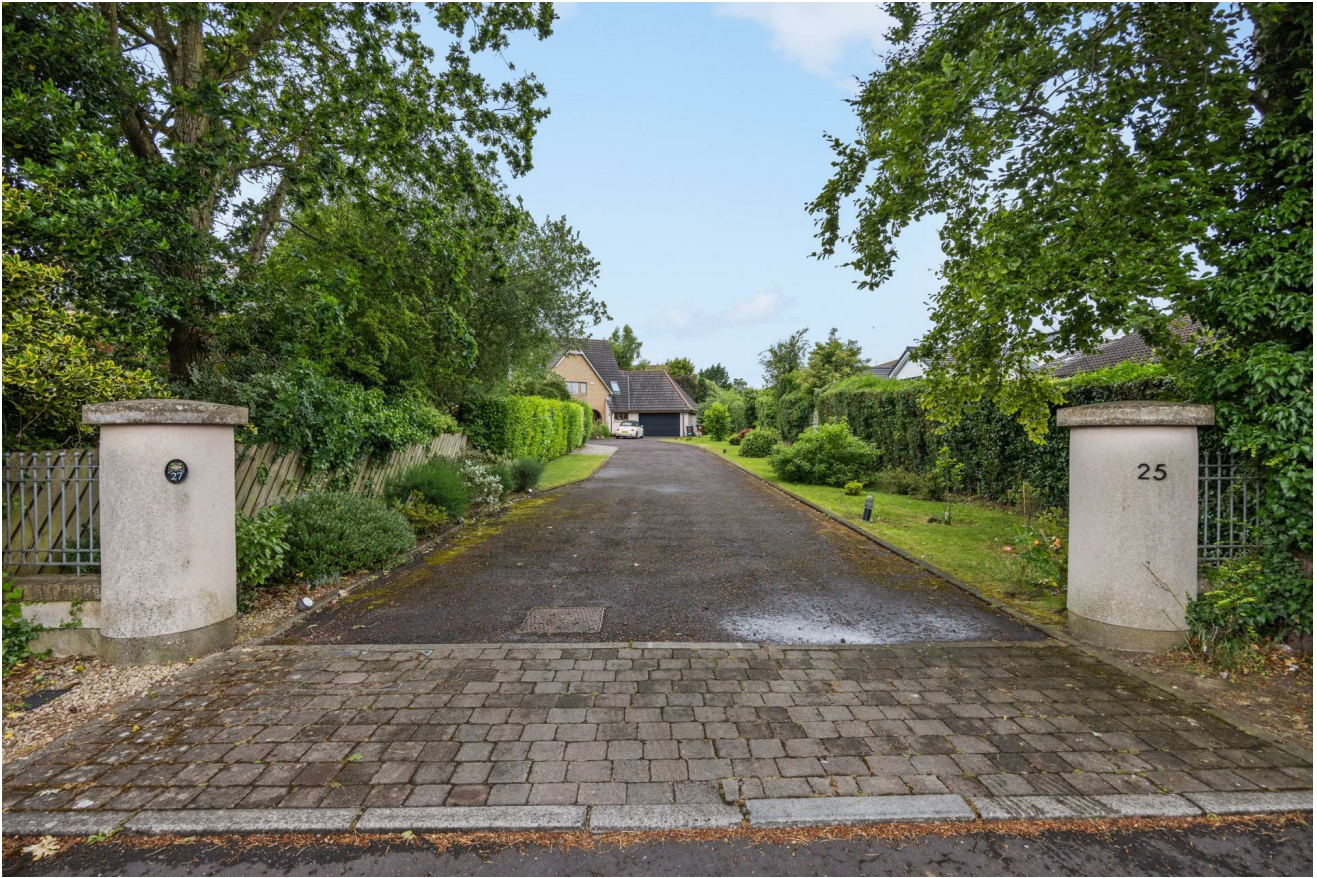
27 Lynda Avenue, Jordanstown, BT37 0NX