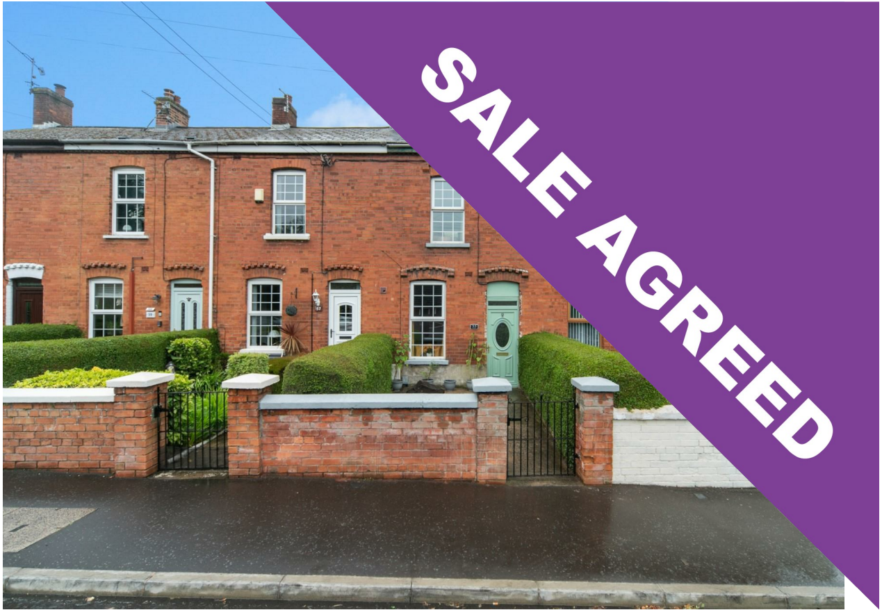
55 Mill Road, Newtownabbey, BT36 7BA