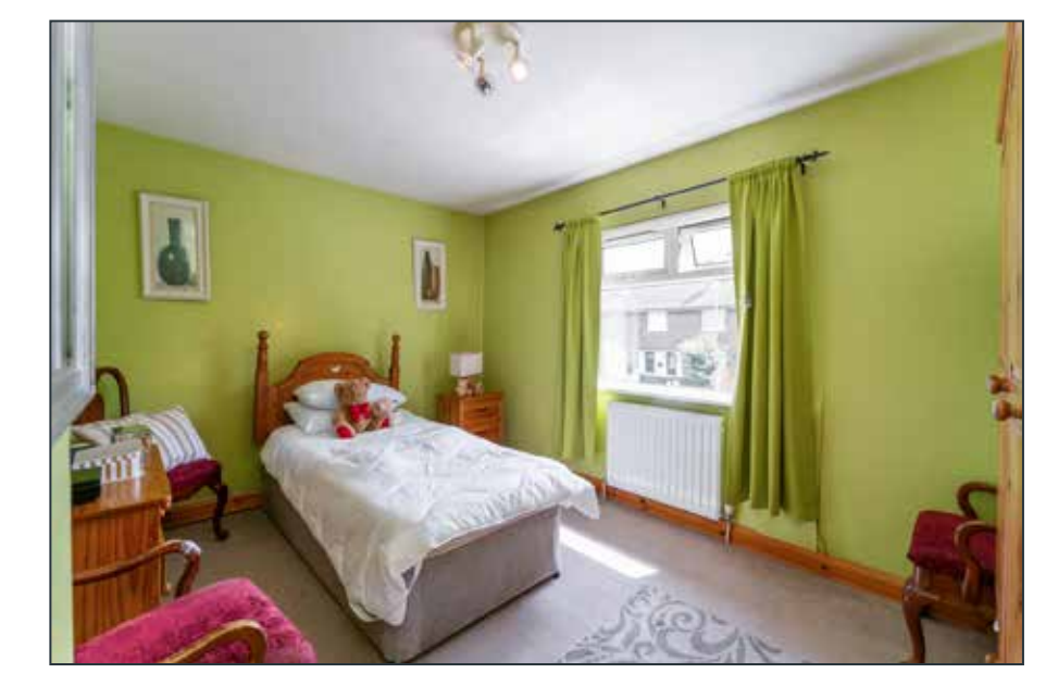
BEDROOM (3): 11' 2" x 7' 10" (3.4m x 2.39m)