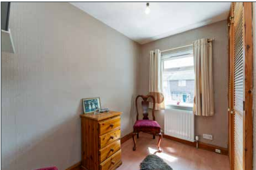
BEDROOM (4): 13' 3" x 9' 6" (4.04m x 2.9m)