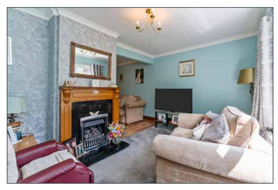
LIVING ROOM: 13' 2" x 9' 6" (4.01m x 2.9m) Gas fire.