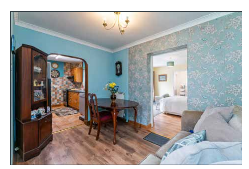
DINING ROOM: 11' 3" x 7' 10" (3.43m x 2.39m)

Wood laminate floor, open arch to Kitchen.