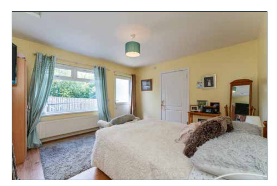
BEDROOM (1): 13' 7" x 12' 8" (4.14m x 3.86m)