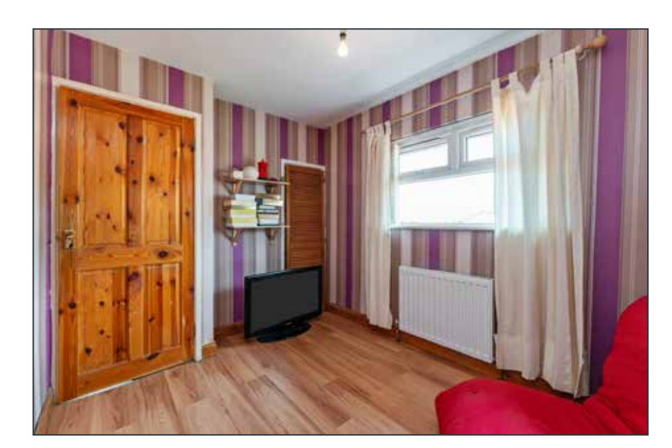
BEDROOM (2): 9' 6" x 6' 0" (2.9m x 1.83m)