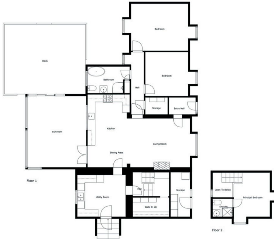
Sizes And Dimensions Are Approximate. Actual May Vary.