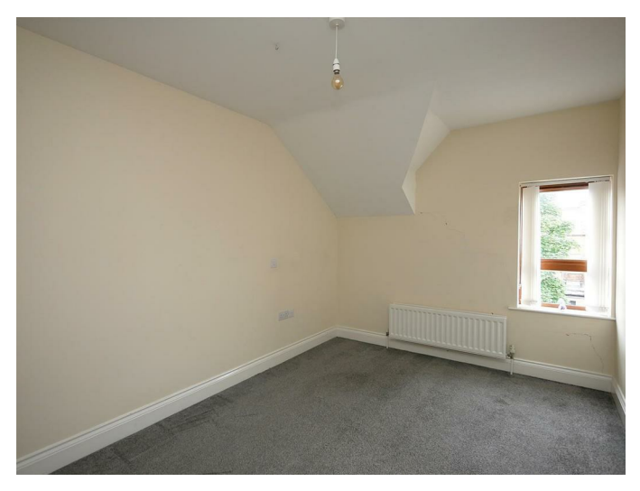
Study / Bedroom 6 10'0" x 6'11" (3.07m x 2.12m)