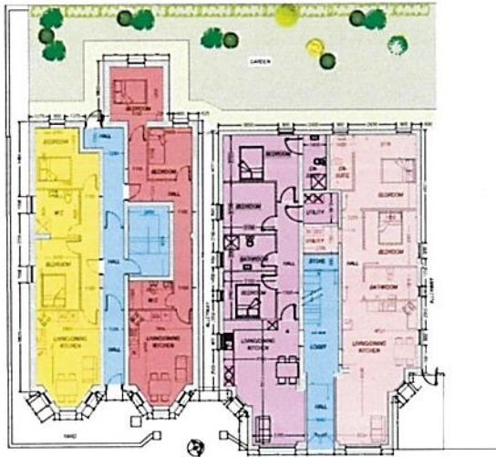
PROPOSED GROUND FLOOR PLAN 1/100