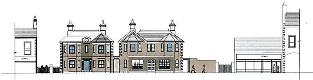
PROPOSED & EXISTING FRONT ELEVATION 1/100