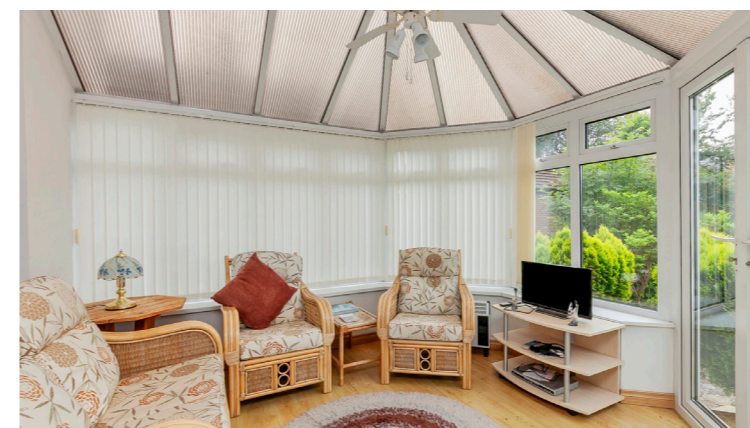
uPVC double glazed Conservatory