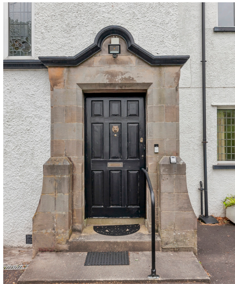
Front door with Scrabo stone surround