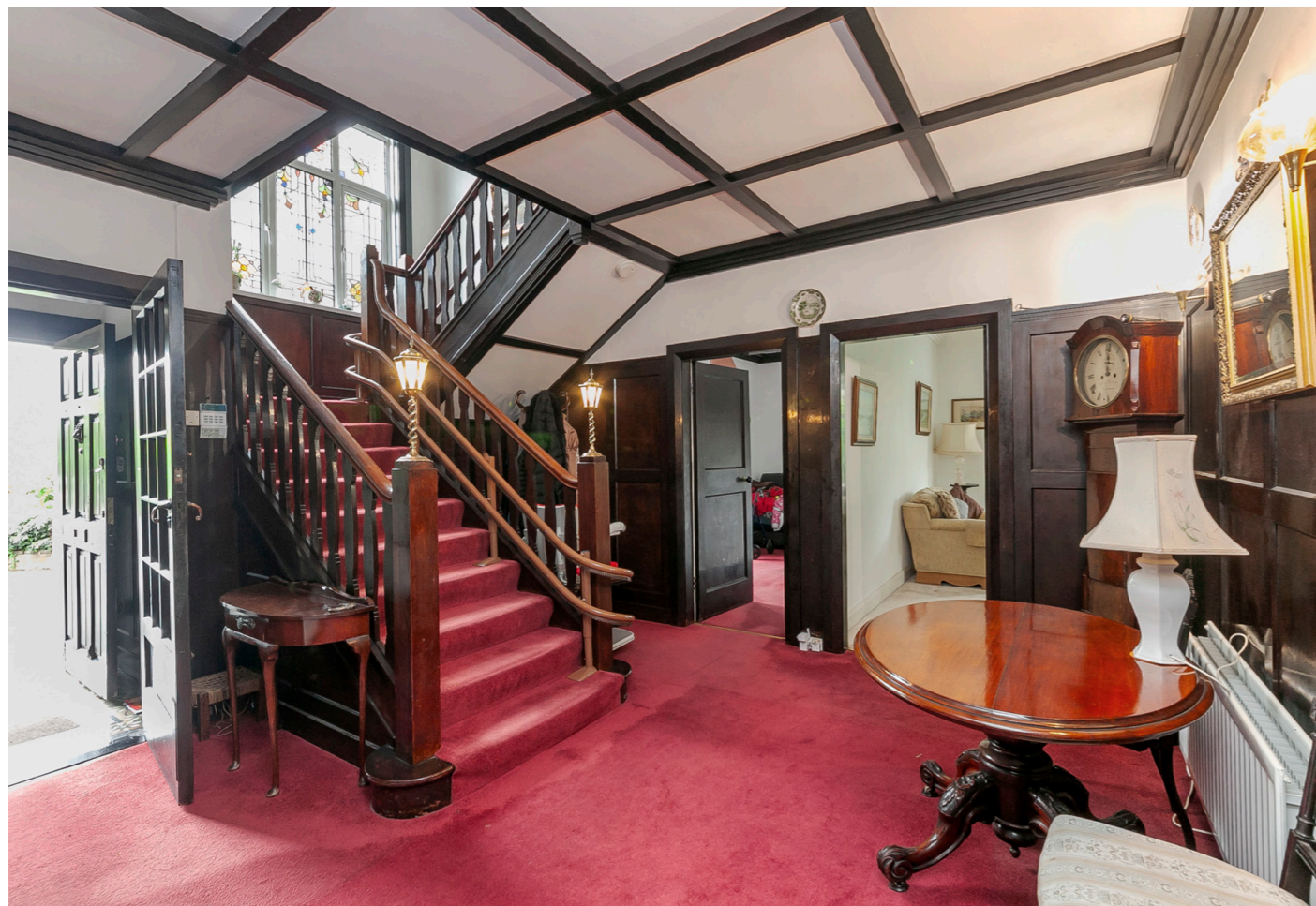
Reception hall with feature staircase