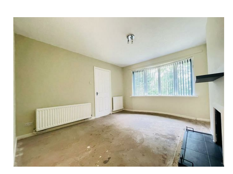
4 Hillcrest Villas Doagh Road, Newtownabbey, BT36 6EE