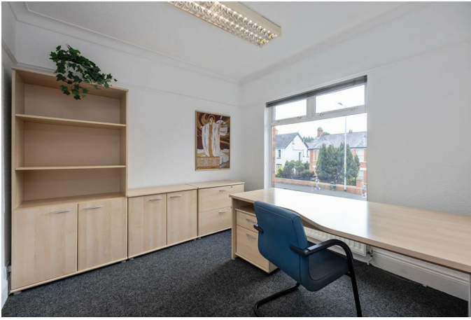
ROOM TWO 10'0 x 9'7 (3.05m x 2.92m)