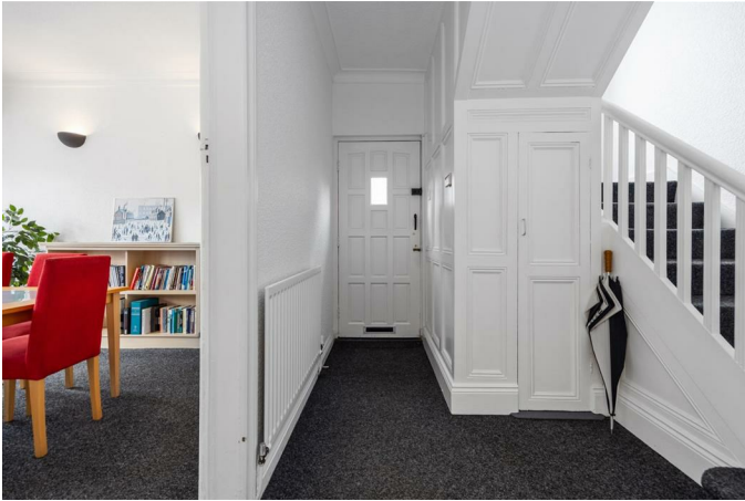
Hardwood front door. Storage off.