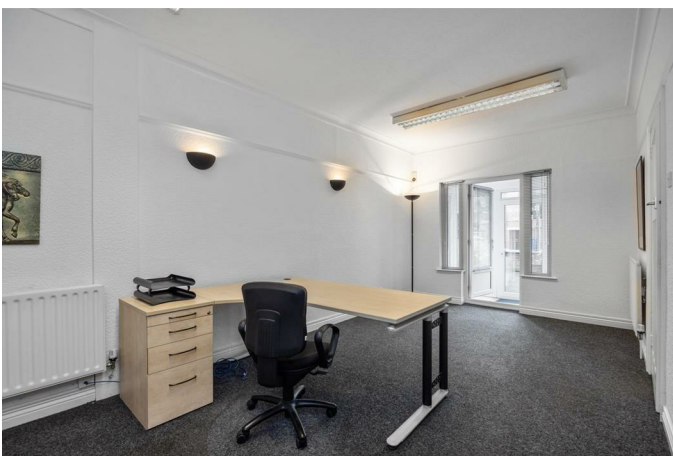
Double doors to reception three.