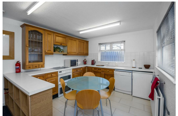
Range of high and low level units, plumbed for dishwasher, sink unit, part tiled walls.