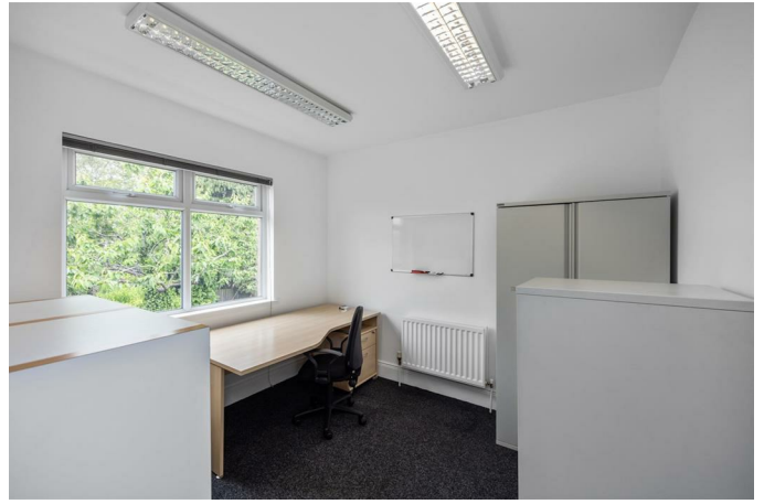
ROOM THREE 10'3 x 9'9 (3.12m x 2.97m)