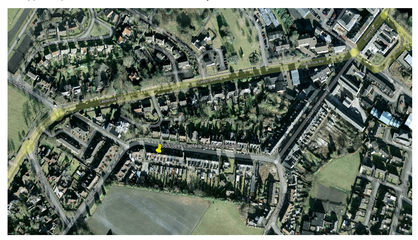
58 Upper Captain Street, Coleraine, Londonderry, BT51 3LZ