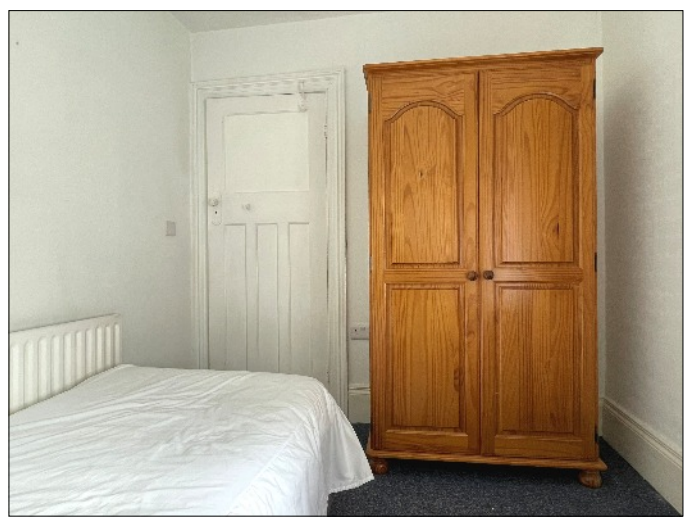
BEDROOM 2 : 10' 2" x 8' 0" (3.09m x 2.43m) (Max)