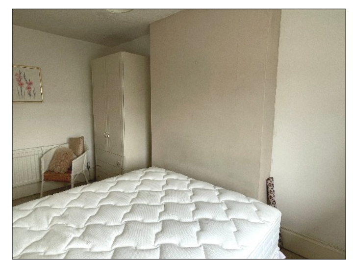
58 Upper Captain Street, Coleraine, Londonderry, BT51 3LZ