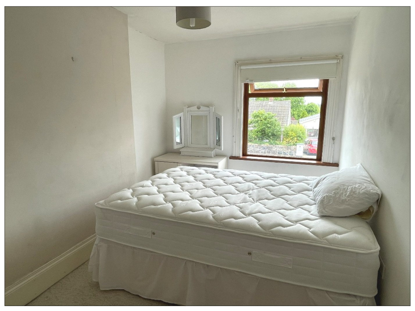
BEDROOM 1: 13' 10" x 8' 6" (4.21m x 2.59m) (Max)