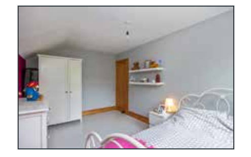
BEDROOM (4): 10' 8" x 10' 5" (3.25m x 3.18m) Outlook to rear, laminate effect wooden flooring.