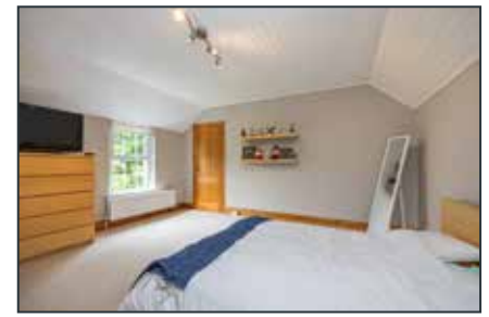
BEDROOM (3): 14' 2" x 9' 5" (4.32m x 2.87m) Outlook to rear, laminate effect wooden flooring.

Outlook to front, pine tongue and groove ceiling, cast iron fireplace.