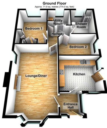
Total area: approx. 71.9 sq. metres (774.0 sq. feet) Images for illustrative purposes only and subject to change. Plans produced using Planigo.