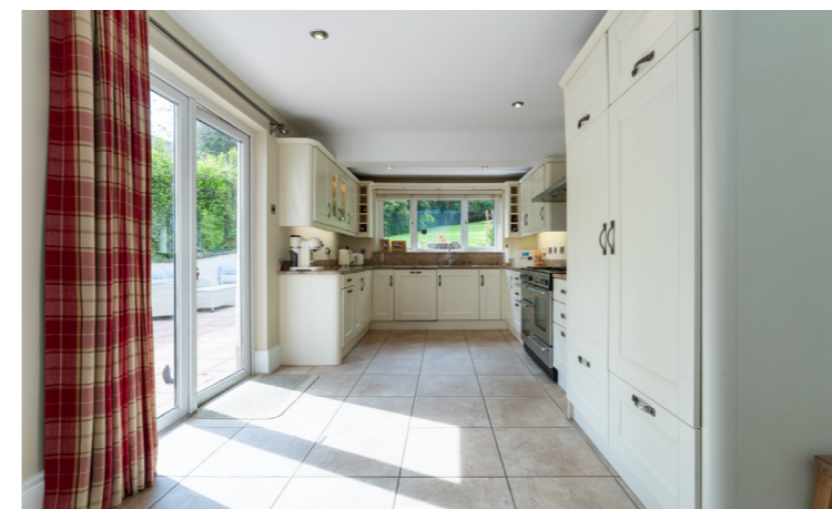
Casual dining area