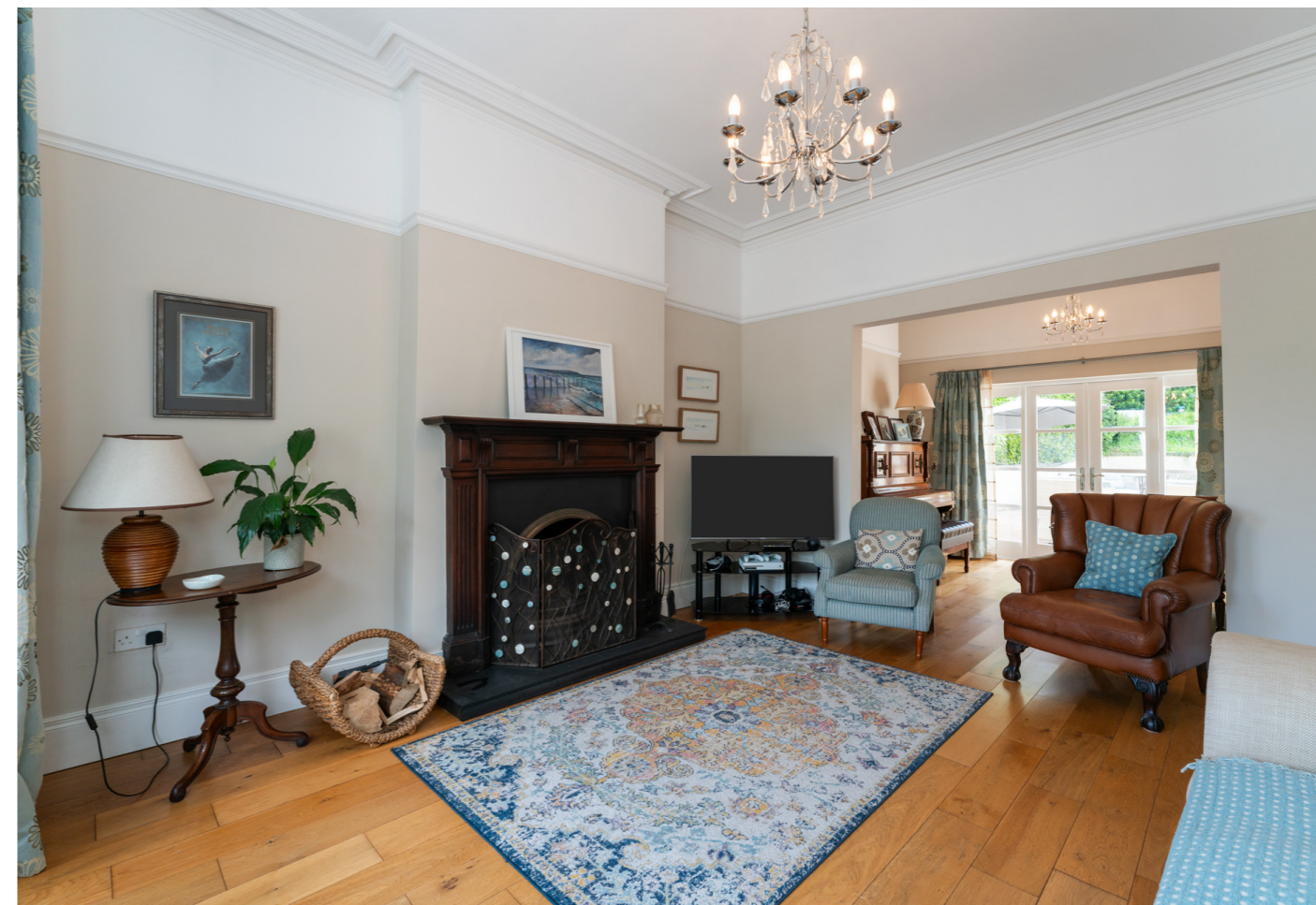
Drawing room with archway to dining room