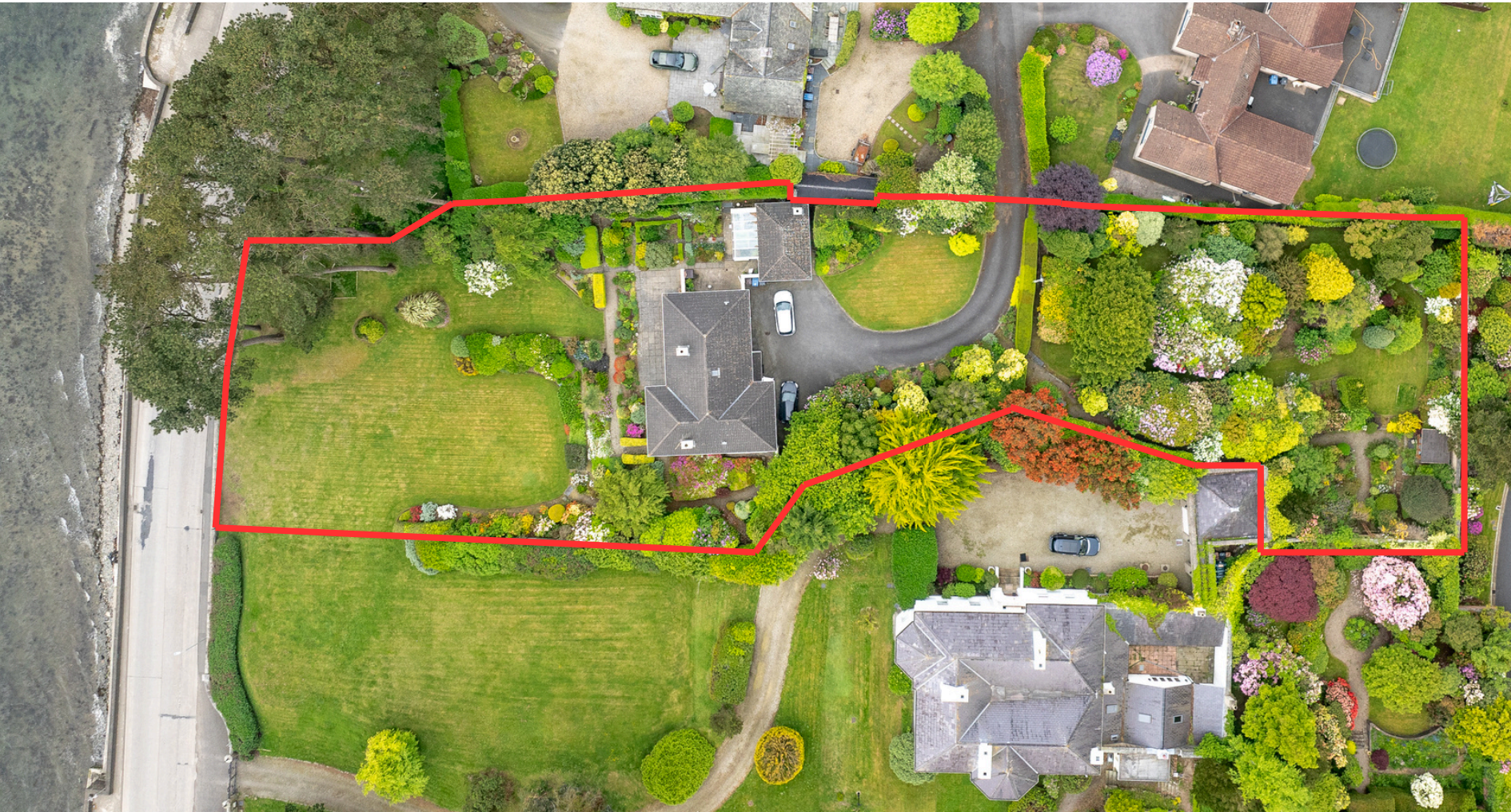
Private Gardens spanning 0.9 acres