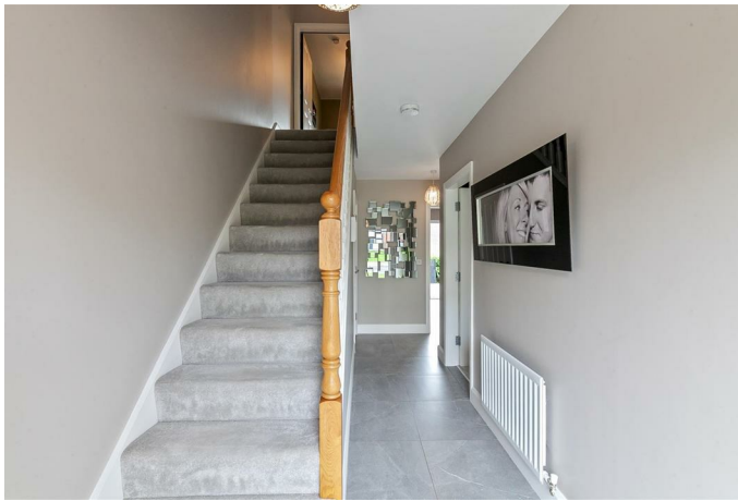
Apeer Composite 5-point locking system front door to entrance hall. Shelved Understairs storage.