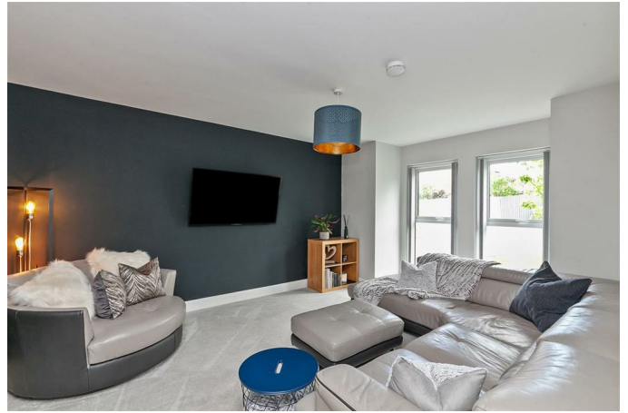
Raised TV points and additional HMDI and Internet Points.