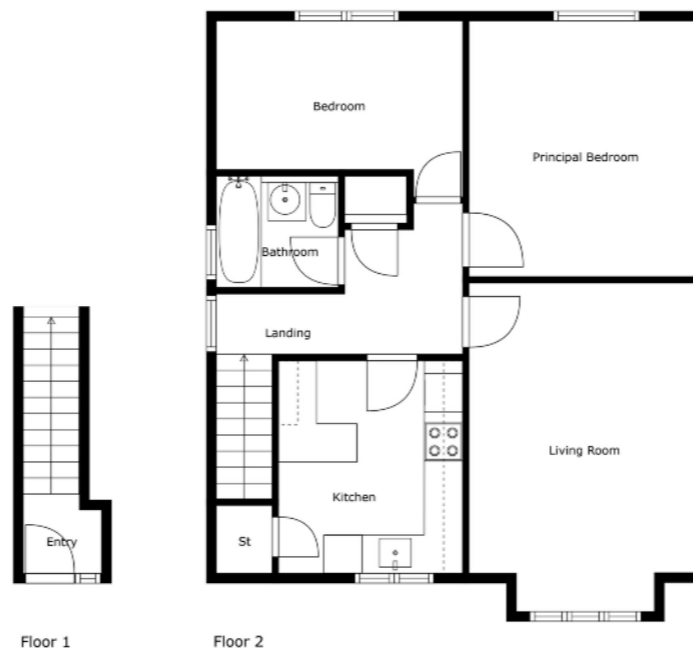
Sizes And Dimensions Are Approximate. Actual May Vary.