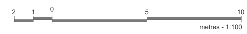
PROPOSED SITE PLAN SCALE 1/100

project PROPOSED HOUSING DEVELOPMENT AT 27 STATION ROAD RANDALSTOWN client FIRST STREET PROPERTY LTD. diag. name PROPOSED SITE PLAN scale 1:100 page A1 date 30.01.23 drawn RC checked JB diag. no. PLANNING DRAWING