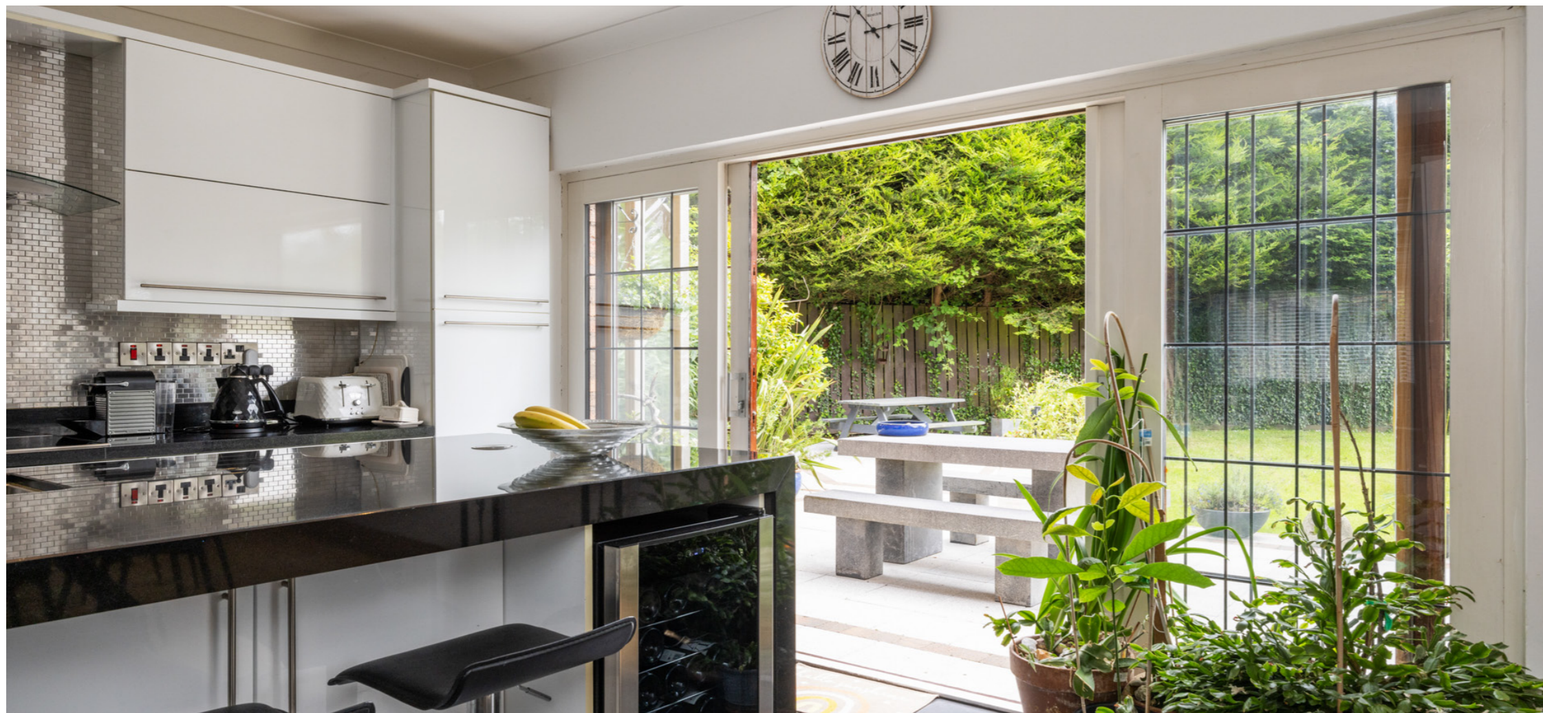
Contemporary kitchen opening onto patio and garden