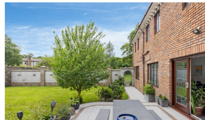
Patio doors out to patio and garden