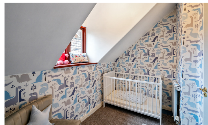
Bedroom five, cot room or study