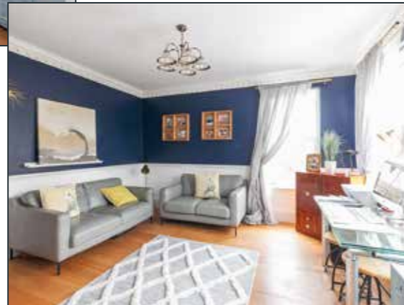
STUDY: 14' 0" x 13' 5" (4.27m x 4.09m) Wooden floor. Cornice ceiling.