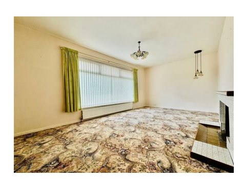
24 Clarke Lodge Road Mallusk, Newtownabbey, BT36 4QY