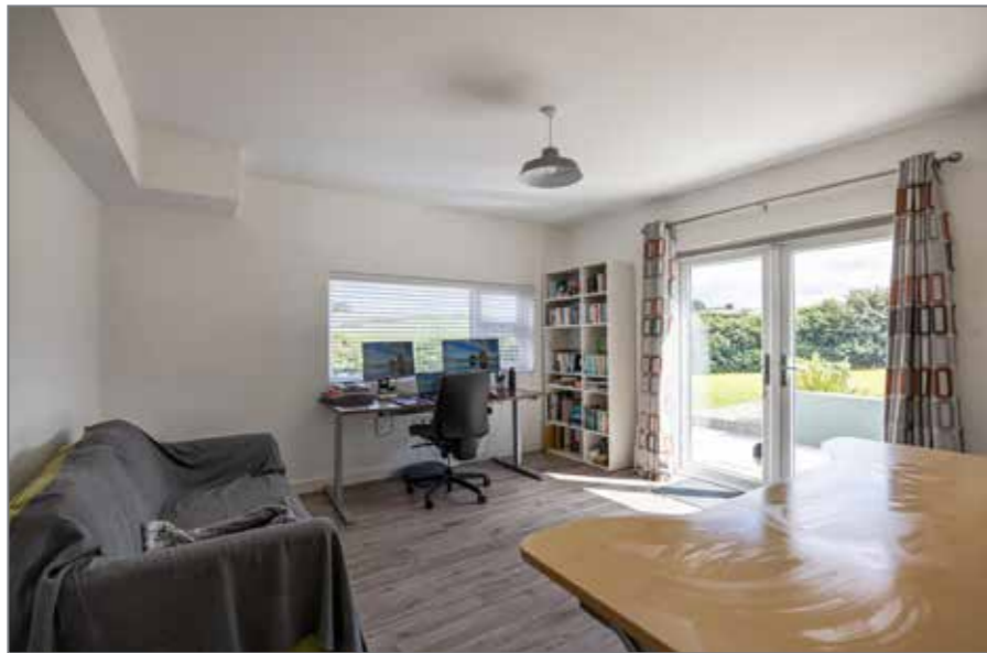
STUDY: 17' 10" x 13' 8" (5.44m x 4.17m) At widest points. Patio doors to rear.