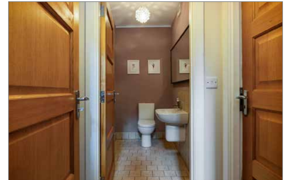
WC: Push button WC, floating wash hand basin with mixer tap.