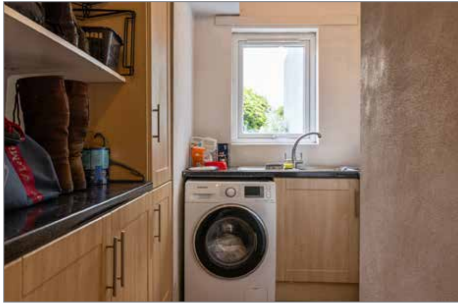
UTILITY ROOM: 14' 7" x 7' 7" (4.44m x 2.31m) High and low level units, plumbed for washing machine and tumble dryer, sink unit with mixer taps.