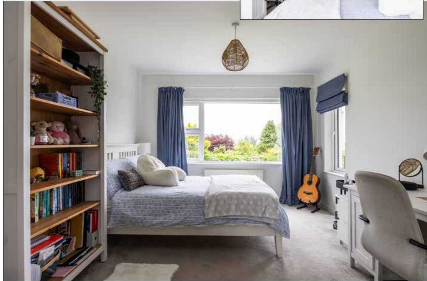
BEDROOM (3): 12' 5" x 11' 9" (3.78m x 3.58m)