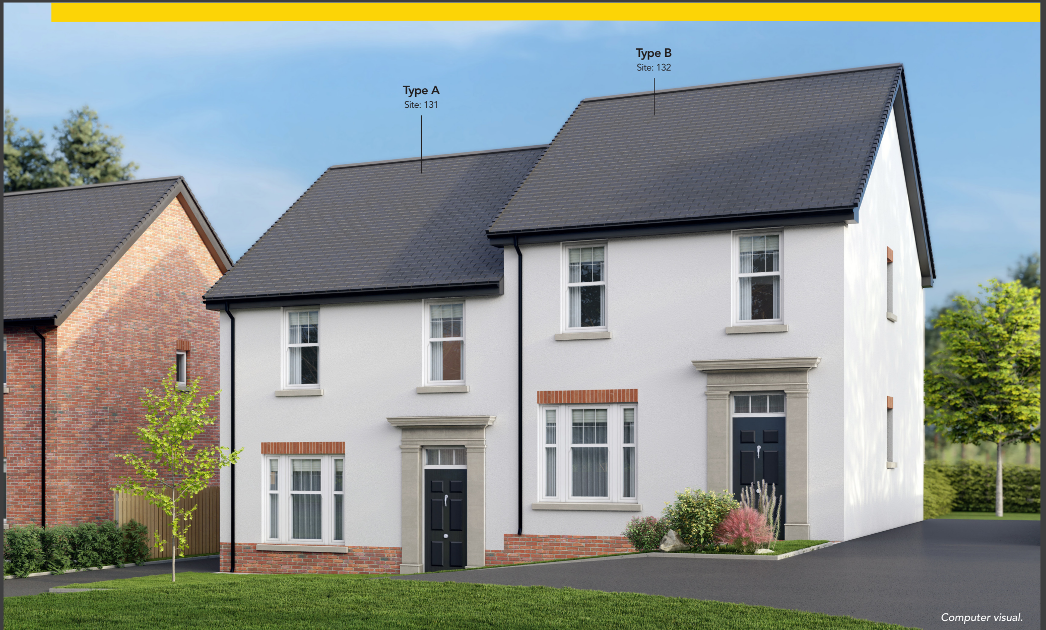
Type B Site: 132