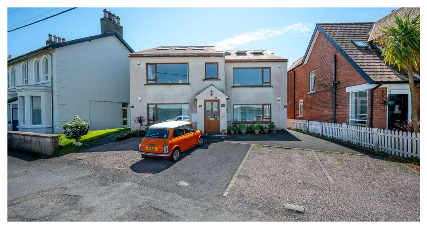
FIRST FLOOR DUPLEX APARTMENT | 2 ⊨ | 2 ≒ | 1 ⊟

12C The Esplanade is a duplex apartment enjoying unrivalled panoramic views over Belfast Lough. There is private parking to the front accessed along The Esplanade.