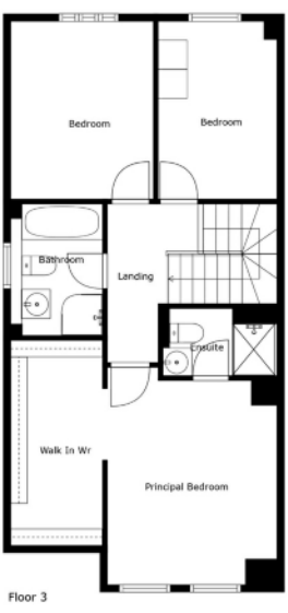
Sizes And Dimensions Are Approximate. Actual May Vary.