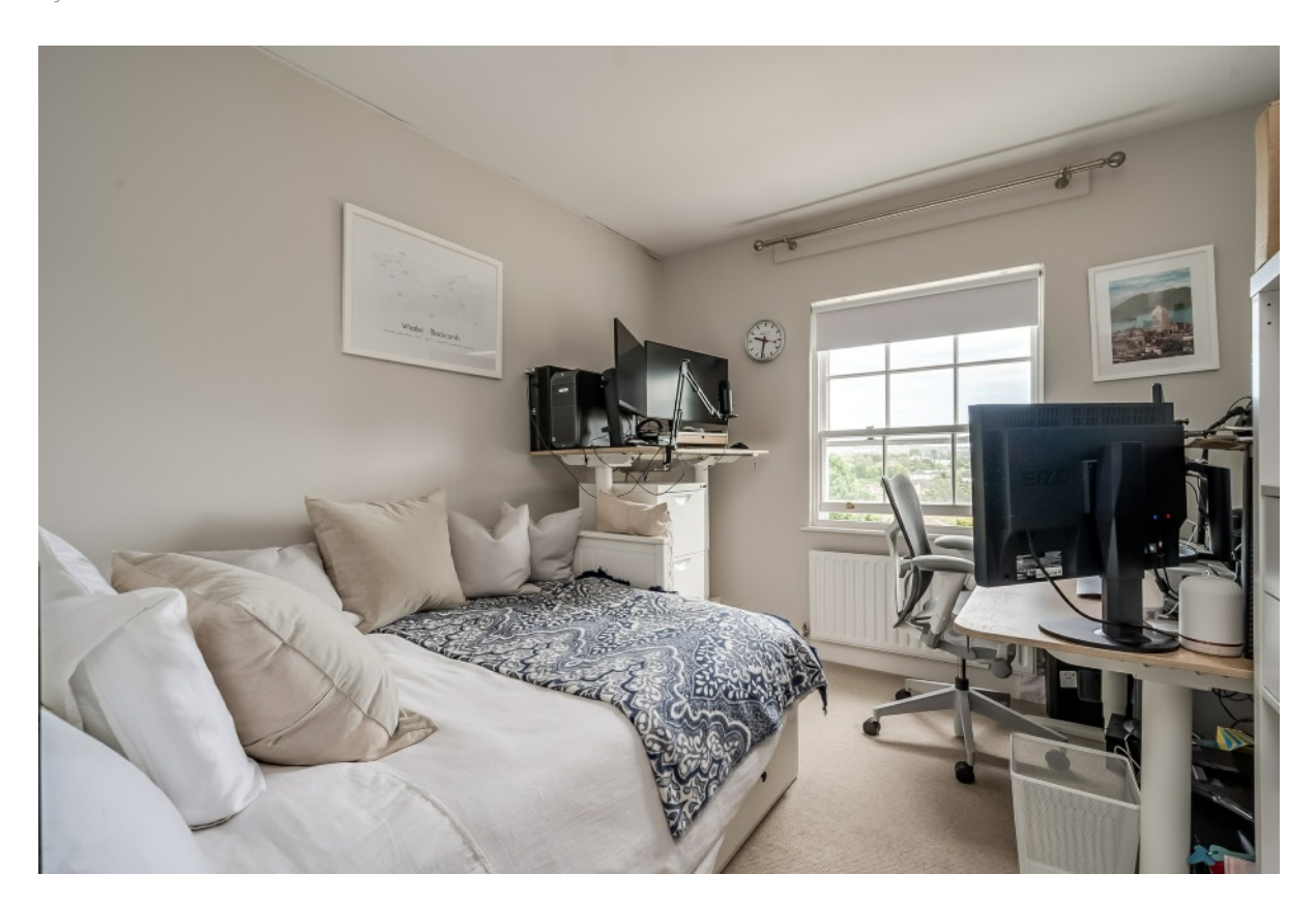
BEDROOM (3): 11' 4" \times 8' 1" (3.45m \times 2.46m) Excellent views across Shaws Bridge and beyond.

BEDROOM (2): 11' 2" \times 9' 6" (3.4m \times 2.9m) Excellent views across Belfast to Shaws Bridge and beyond.