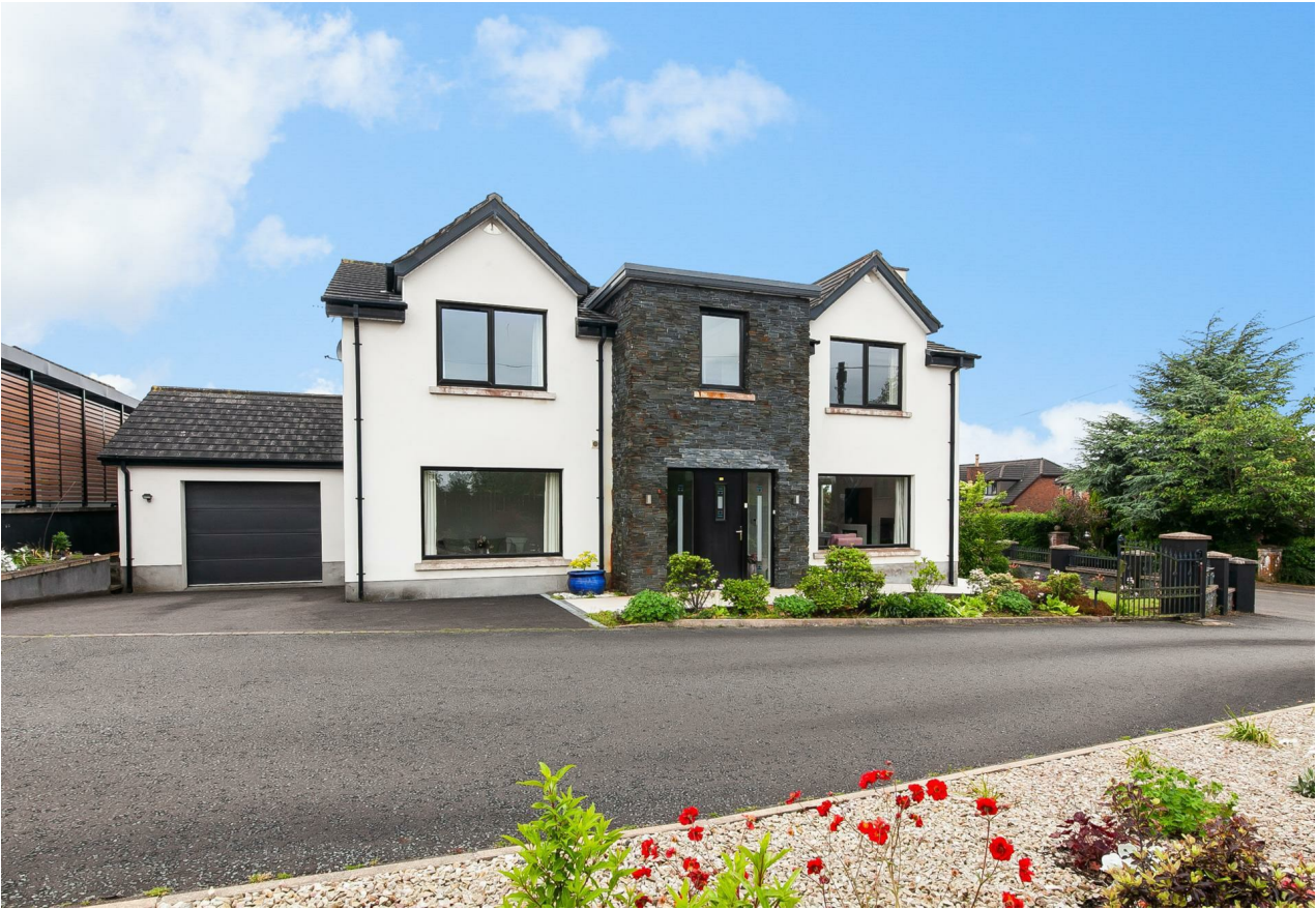
18b Kilmakee Road, Templepatrick, BT39 0EP