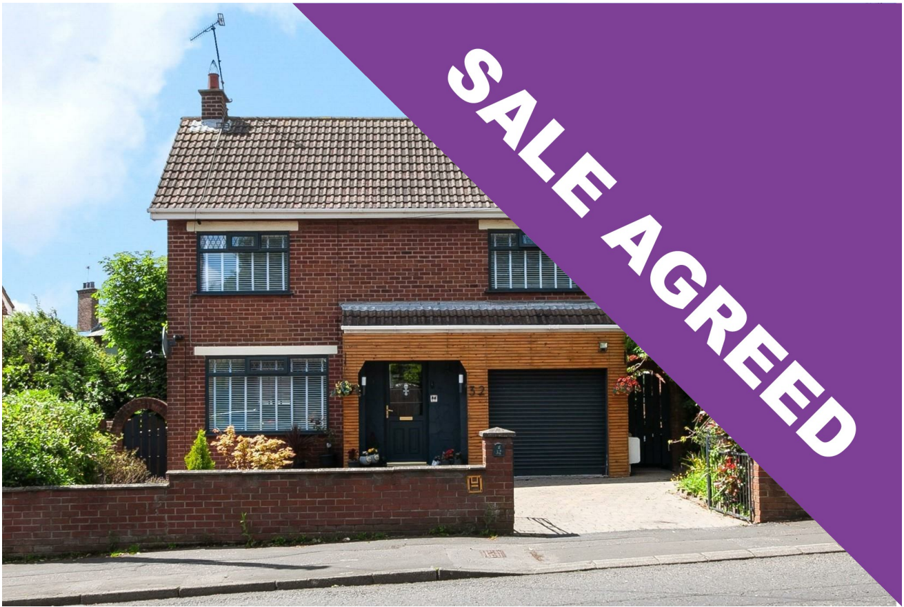
32 Doagh Road, Newtownabbey, BT37 9NY