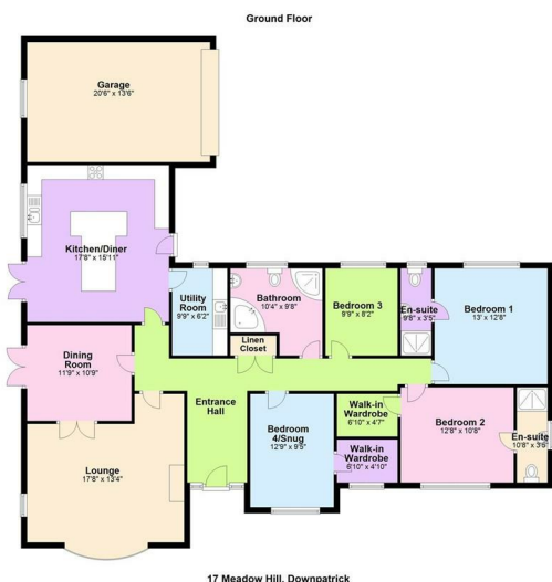
17 Meadow Hill, Downpatrick