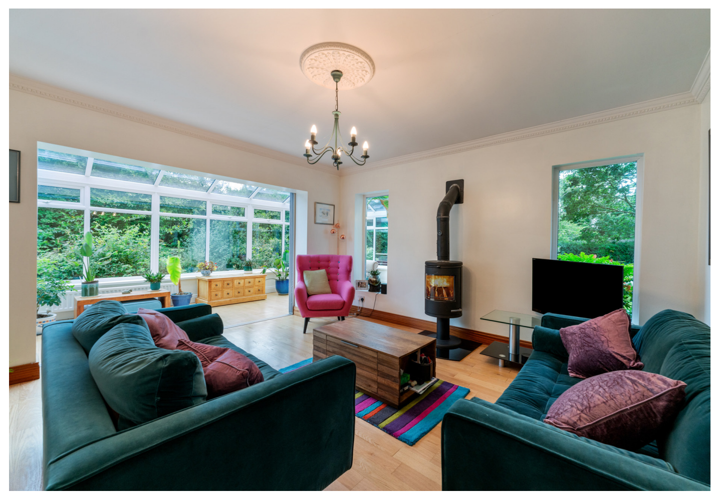
Family Room opening into Conservatory