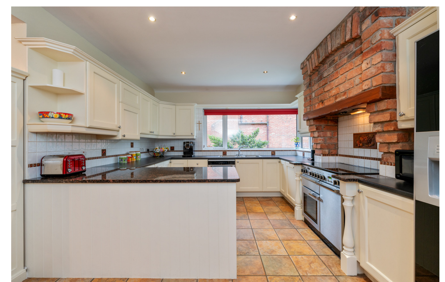
Shaker style kitchen with range recess