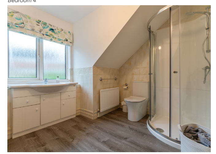
Shower room on second floor