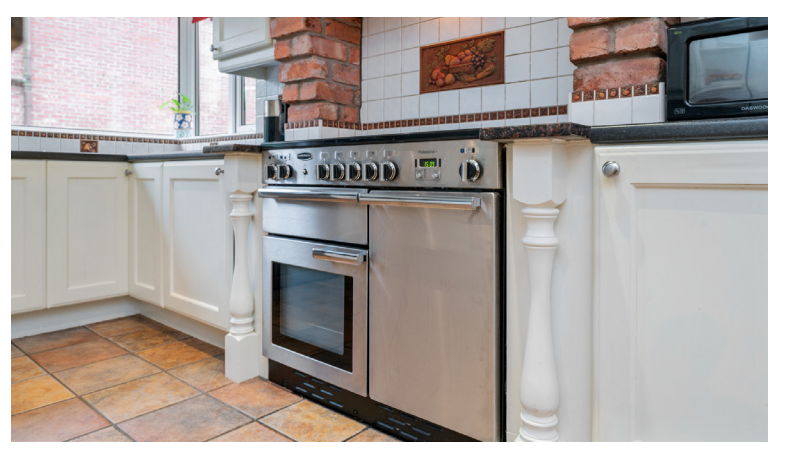
Stainless- steel range cooker