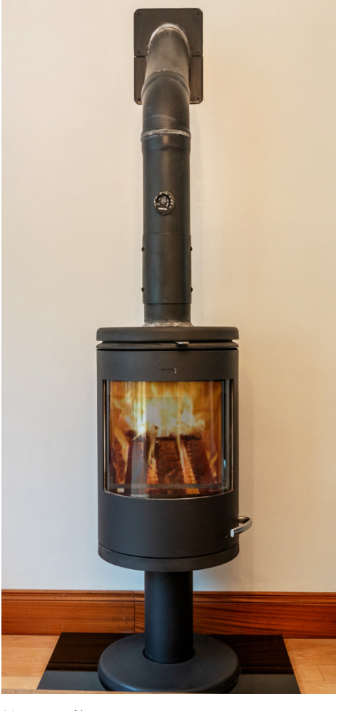
Morso wood burning stove