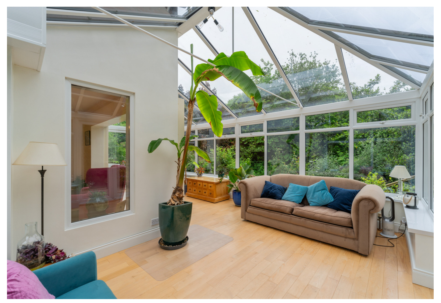
Large double glazed conservatory