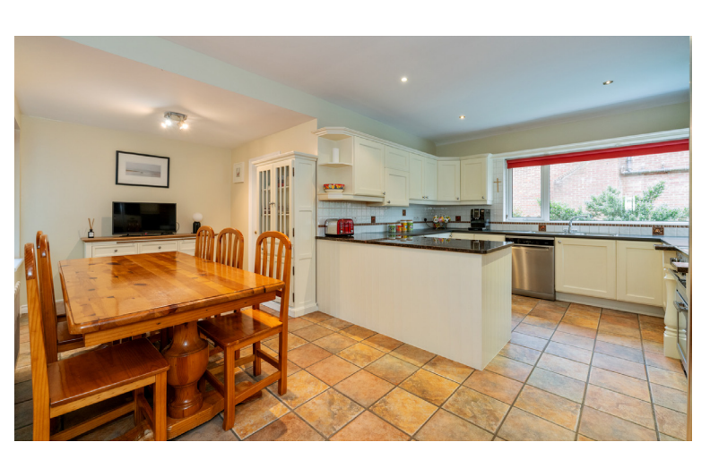
Kitchen with space for dining