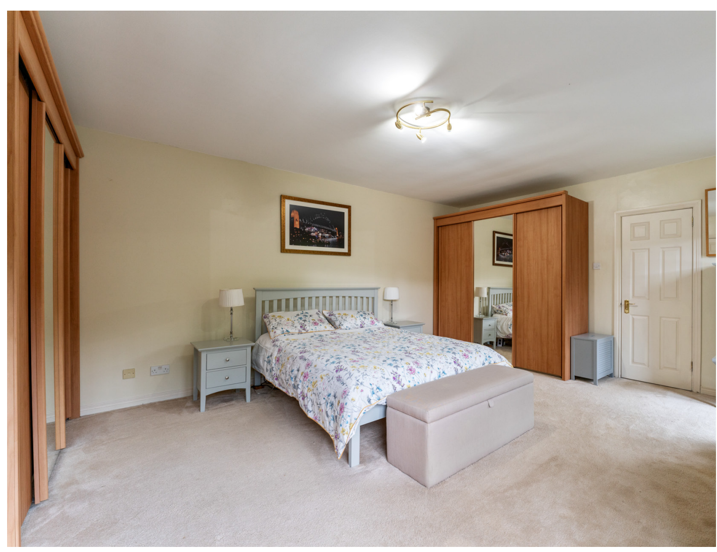
Main bedroom with built-in wardrobes