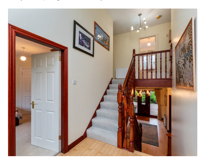
First floor landing