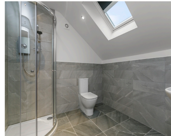
Ensuite shower room

Tarmac driveway with parking for three plus cars.