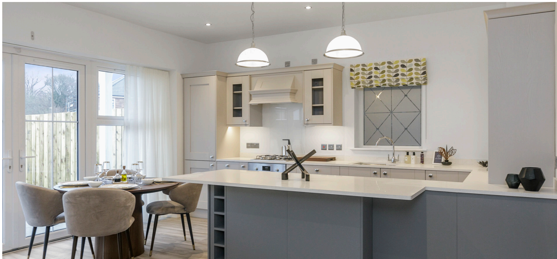
Luxury kitchen opening to casual living and dining