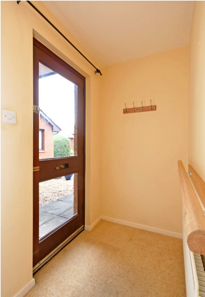
Entrance Hall 3'10" x 15'1" (1.17m x 4.62m)

Glazed hardwood front door opens onto entrance hall. Access to built-in storage cupboard and hot press.