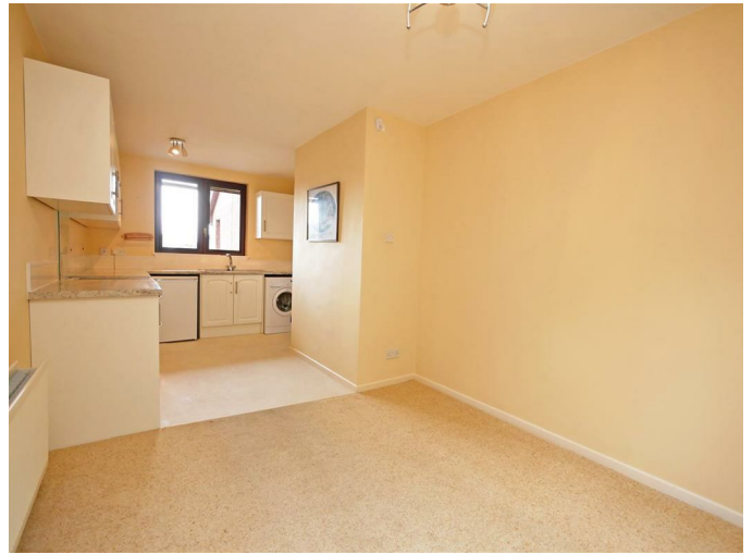
Dining Area 9'8" x 8'8" (2.97m x 2.66m)

Dining area open to kitchen. Glazed upvc patio doors open onto enclosed rear garden.