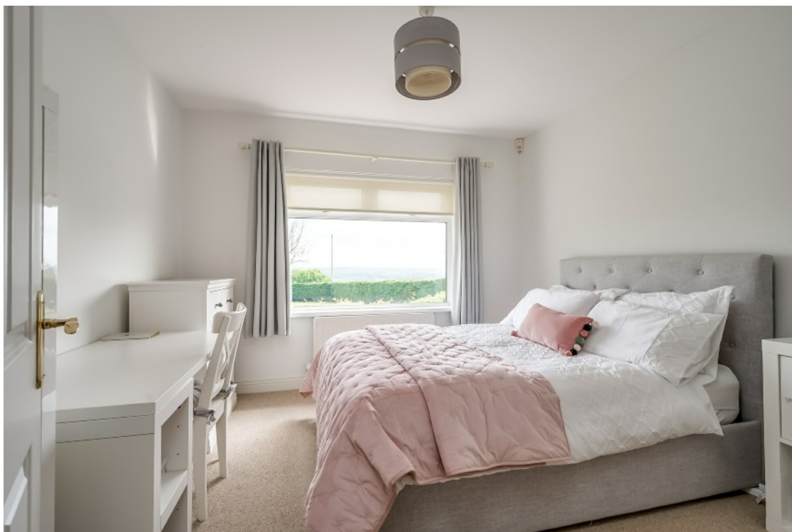
BEDROOM (4): 10' 9" x 10' 7" (3.28m x 3.23m) Range of built-in robes.