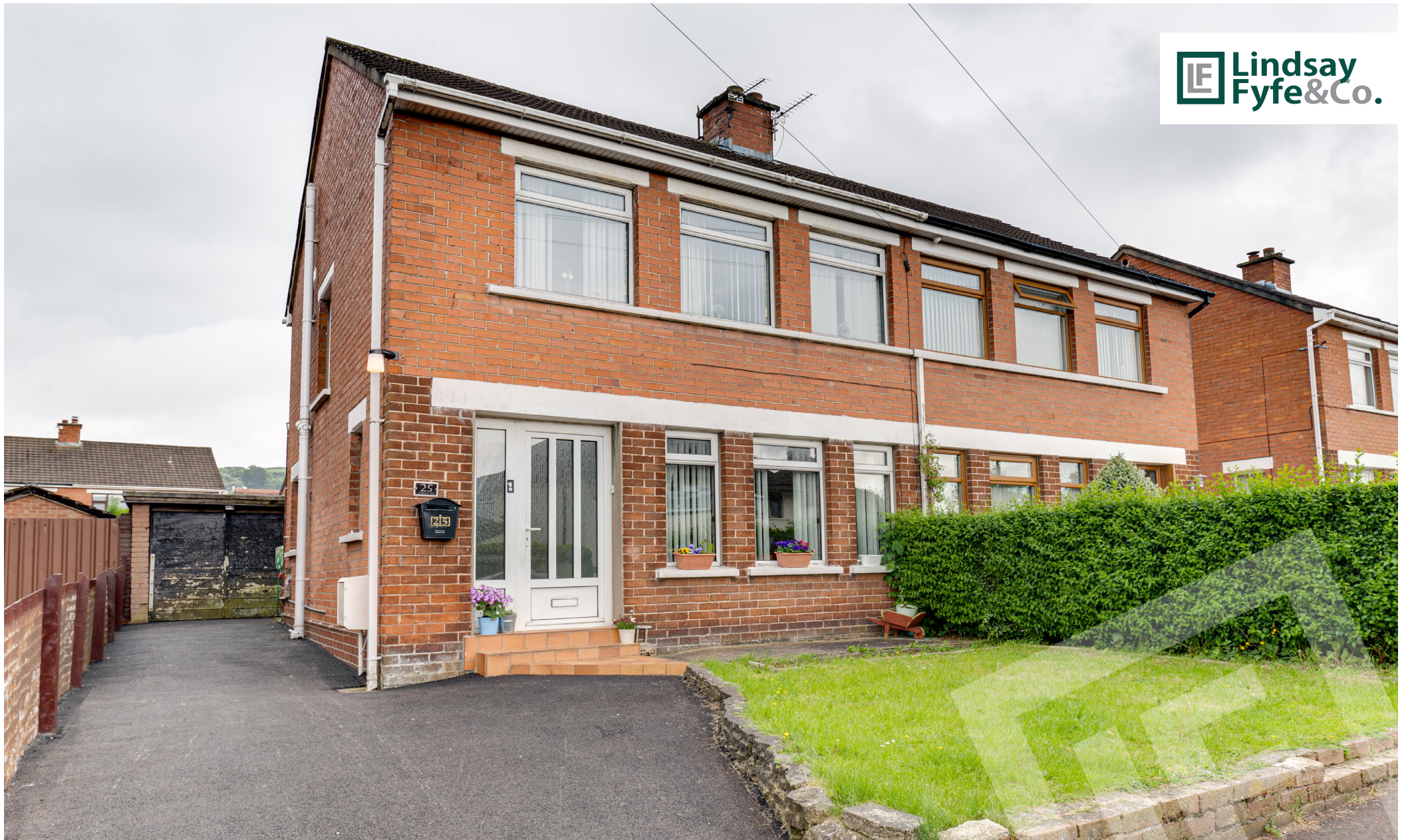
25 Stirling Avenue, Belfast, BT6 9LQ Traditional Red Brick Semi In An Established And Popular Location - £195,000