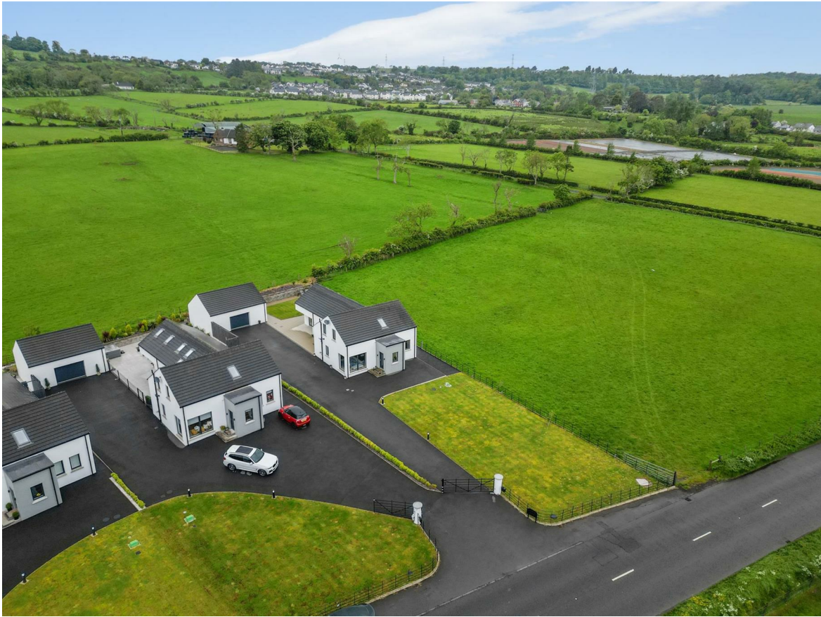
'Gracefield Manor', 62 Larne Road, Ballycarry, BT38 9JR