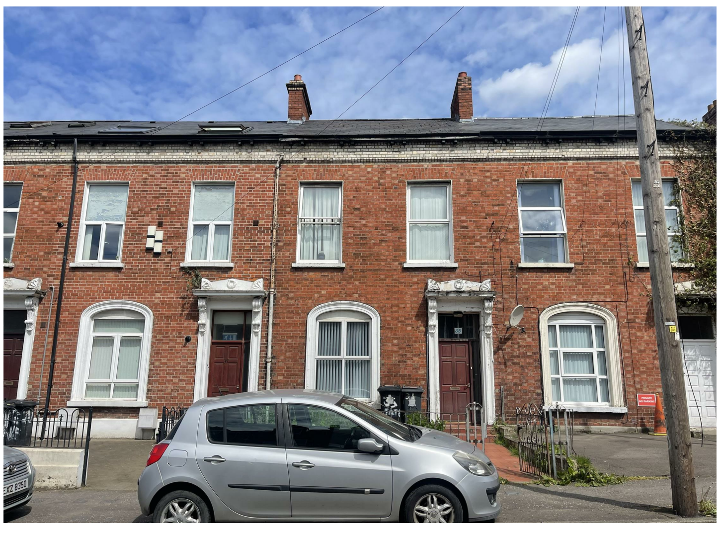
35 Tates Avenue, Belfast, BT9 7BY