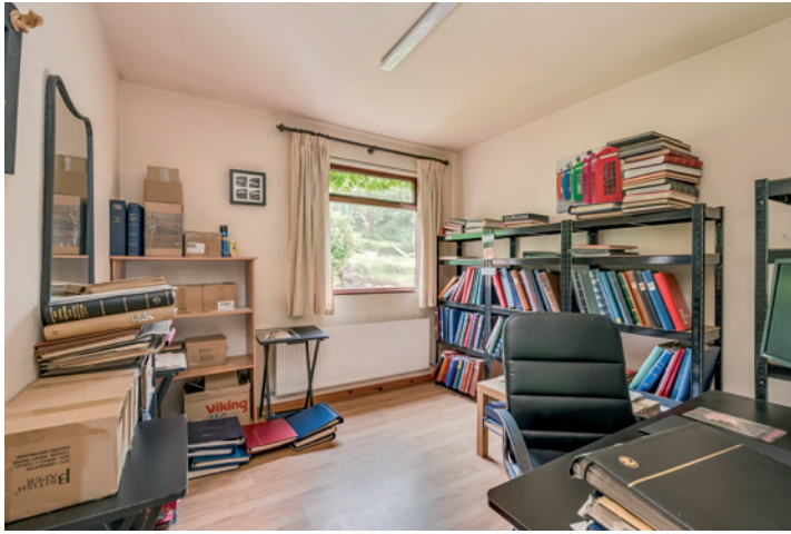
BEDROOM (5): 13' 3" \times 10' 6" (4.04m \times 3.2m) Laminate wood effect floor. STUDY: 9' 6" \times 7' 10" (2.9m \times 2.39m) Laminate wood effect floor, skylight.