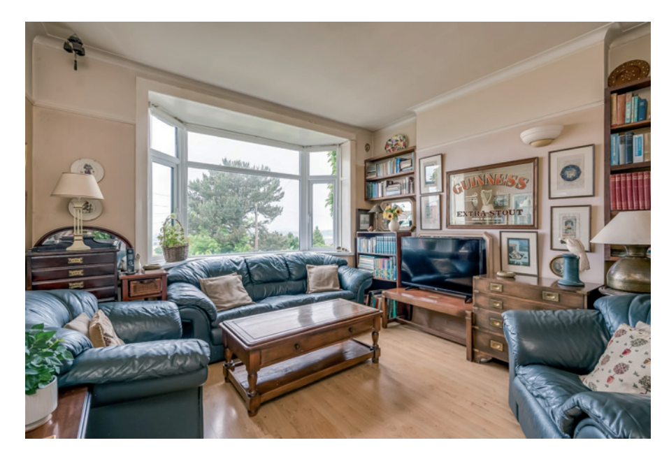
LIVING ROOM: 12' 1" \times 10' 5" (3.68m \times 3.18m) Picture rail.