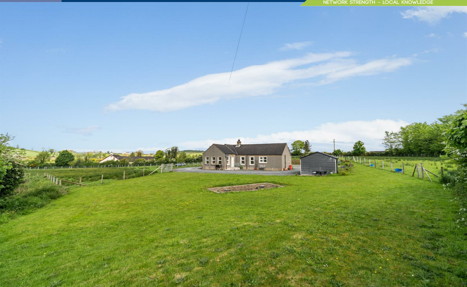
4 MOSSVALE ROAD, BALLYNAHINCH, BT24 8SR