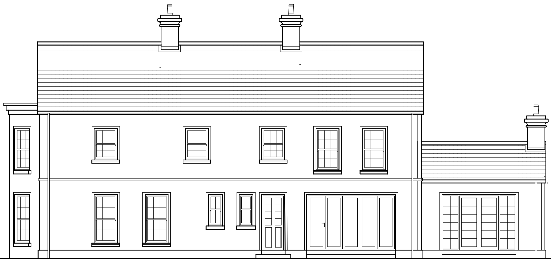
PROPOSED REAR ELEVATION...1/100.