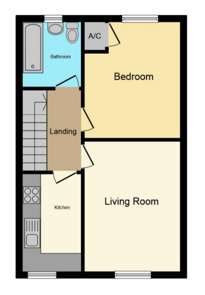
Floor Plan This plan is for illustration purposes only and may not be representative of the property. Plan not to scale. Powered by audioagent.com