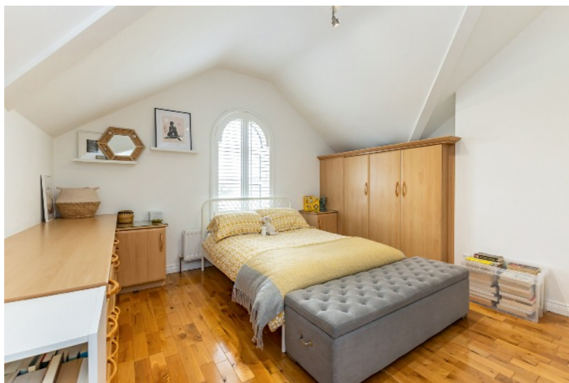
BEDROOM (3): 12' 7" x 12' 3" (3.84m x 3.73m) Solid oak flooring, built-in robe.