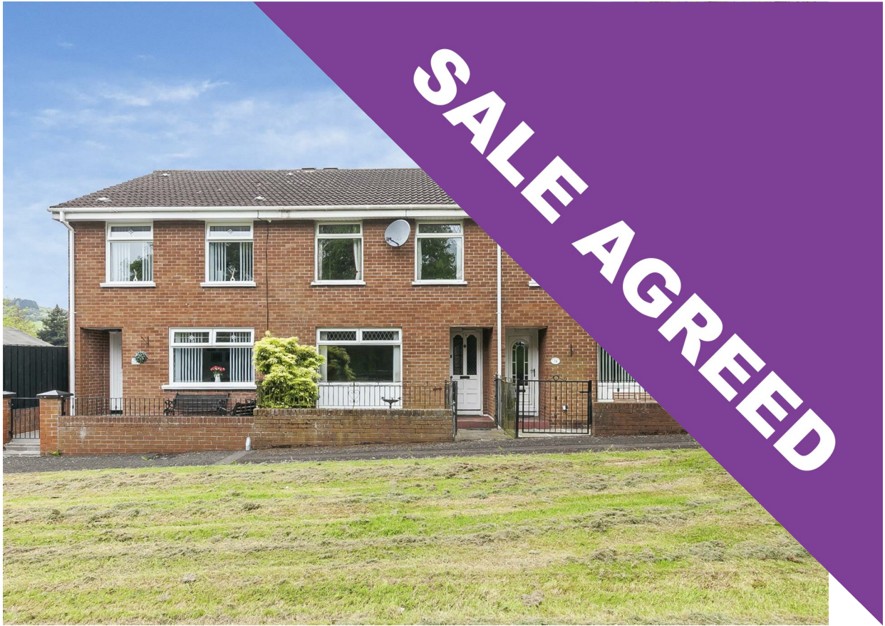
74 Monkstown Road, Newtownabbey, BT37 0ED